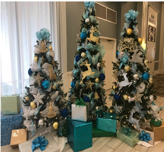
The lobby of Edgewater Beach Conference Center was adorned in the Christmas spirit by Kirby Holt.