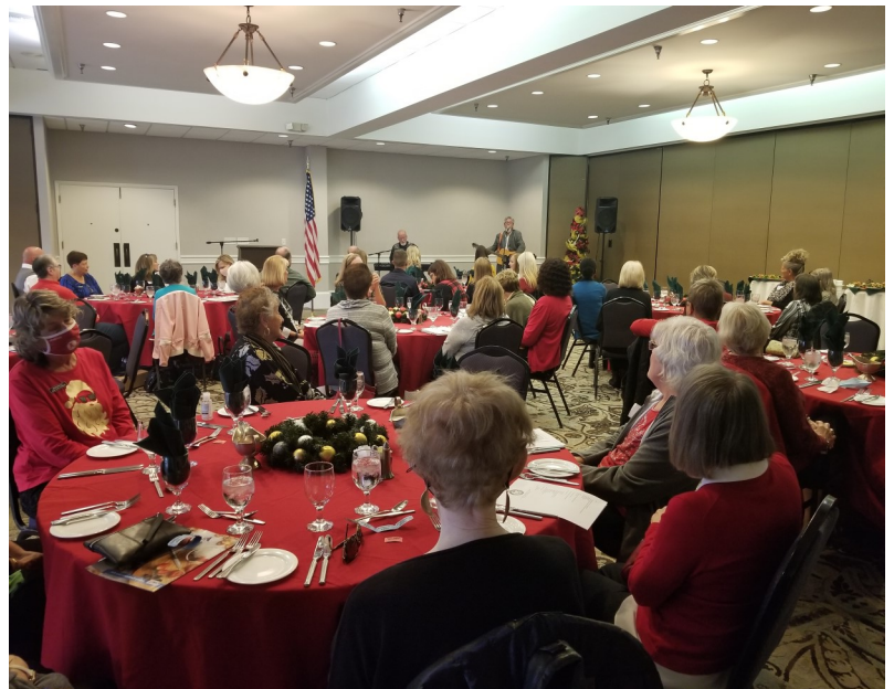
The musical program put everyone into the Christmas Spirit. The food was excellent and the decorations were beautiful.