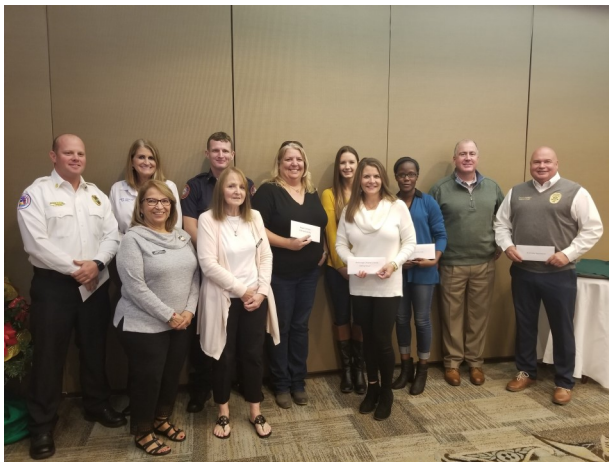
Those receiving 2020 donations represent the Bay County Sheriff's Dept., PCB Police, Beach Care Services, Boys & Girls Club, Community Food Pantry, Maggie Still Park, PCB Fire Dept., Thomas Drive Volunteer Fire Dept., West End Vol. Fire Dept., PCB Library, Supper at Grace and McKelvey Home. They were very pleased and thankful!